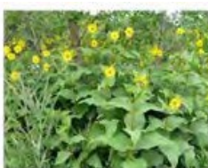
Indian cup plant