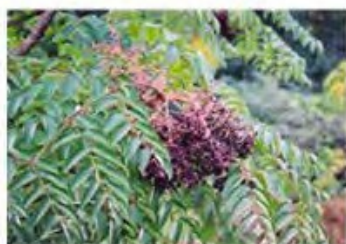
Japanese angelica tree