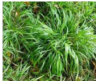
Slender false brome