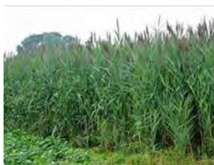
Common reed grass