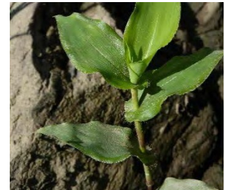
Small Carpet Grass