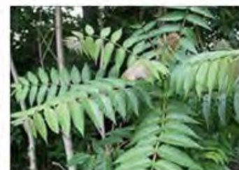
Tree of heaven