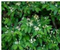
Bush honeysuckle spp.