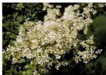
Japanese tree lilac