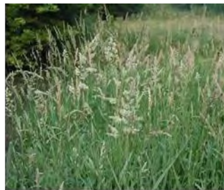
Reed canary grass