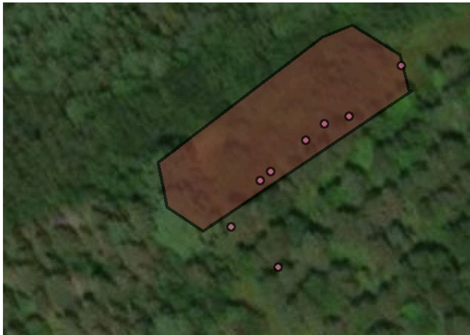
Image of Treatment area from 07/29/2021