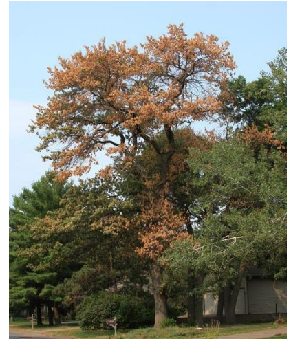
Oak tree killed by oak wilt

Spread underground occurs when roots of nearby red group oaks graft to each other (fuse together), creating a connection through which nutrients and the disease can move. In the Midwest, large blocks of red oak forests have died from the disease in a single season due to their vast network of interconnected roots. In contrast, white group oaks are much less likely to create root grafts, and spore mats rarely form under their bark, significantly reducing the chance of spread from these trees.