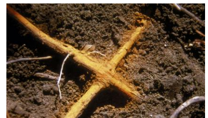
Root graft