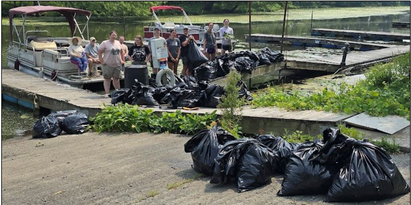
Figure 8. Group photo. Pictured are 10 of 11 participants, along with the 39 bags (approx. 1,300 lbs.) of removed biomass.