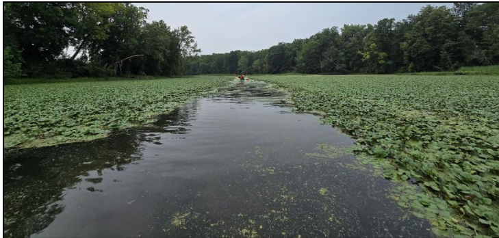
Figure 3. Northern end of 2025 treatment polygon. Water Chestnut is shown covering a majority of the water's surface with only a narrow path down the middle.