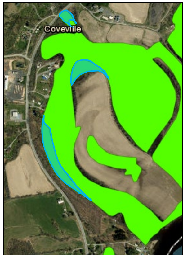
Figure 1. Previously Mapped Freshwater Wetlands. Bright green shapes = Class 2 Wetlands; blue = Class 1 wetlands.

An initial Water Chestnut pull was conducted in 2024, focusing on large mats that had migrated further up The Cove after intense storms (remnants of hurricanes) dislodged them from the main monoculture further down The Cove. The owners continue to hand pull on their own nearly every day during the summers, both around the upper marina as well as attempting to maintain a boating access path through the monoculture, though they are unable to effectively manage it by themselves and the path routinely closes up.